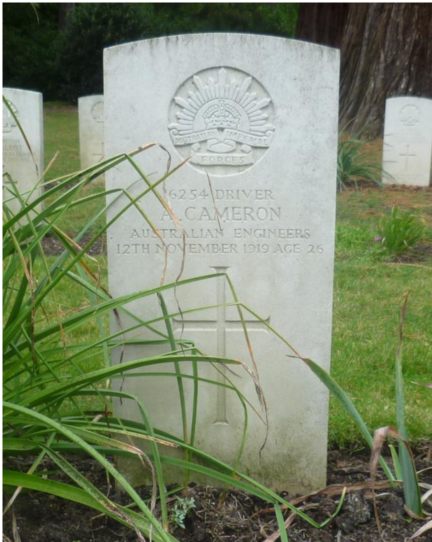
Photo of Driver A. Cameron's Commonwealth War Graves Commission Headstone in Brookwood Military Cemetery, Surrey, England.