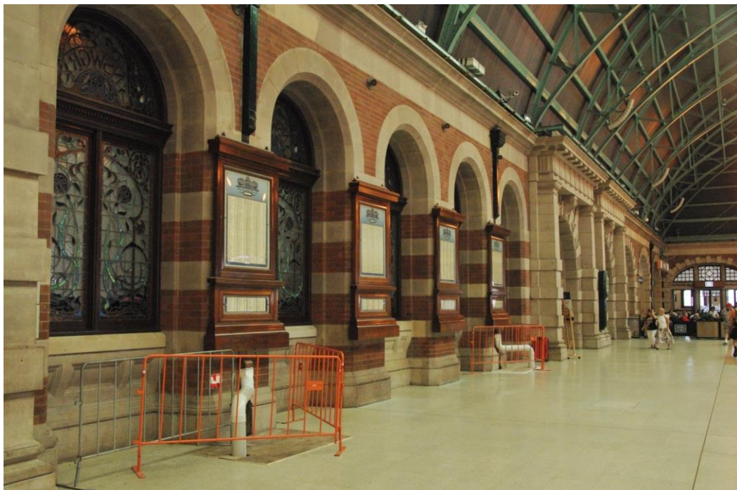
NSW Government Railways & Tramways Roll of Honour