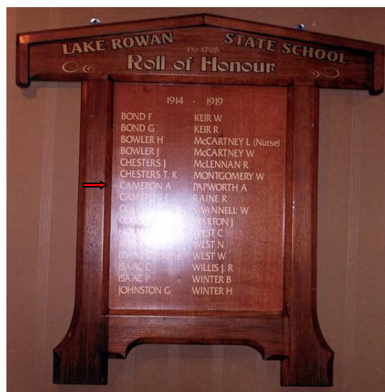
Lake Rowan State School Roll of Honour